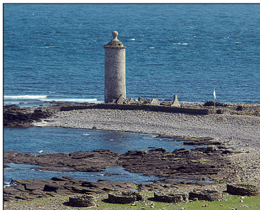
Dennis Head Beacon