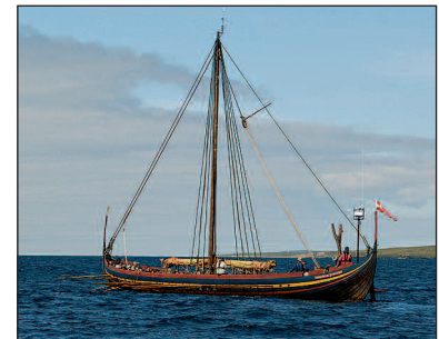
"Sea Stallion" at Kirkwall