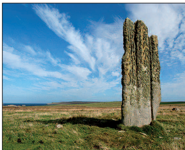
Stone of Setter, Eday