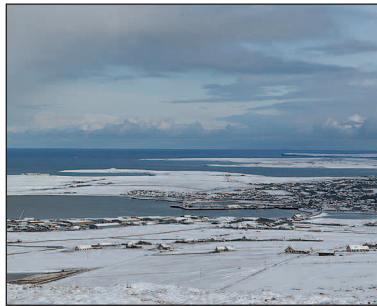
Kirkwall from Wideford Hill