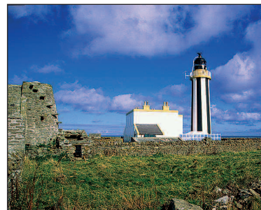
Start Point, Sanday