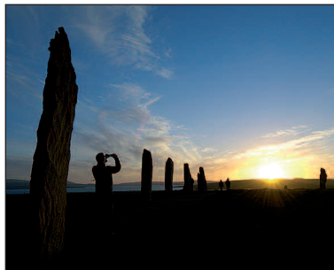
Brodgar midsummer sunset