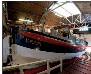
Longhope Lifeboat Museum