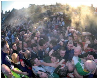
The Ba' on Broad Street