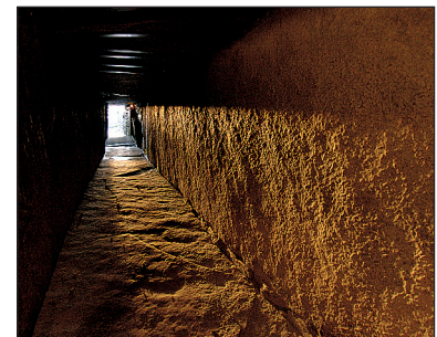
Maeshowe midwinter sunset